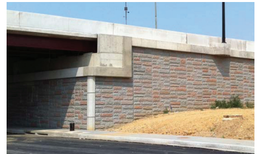
11th Street Bridge Washington, D.C.