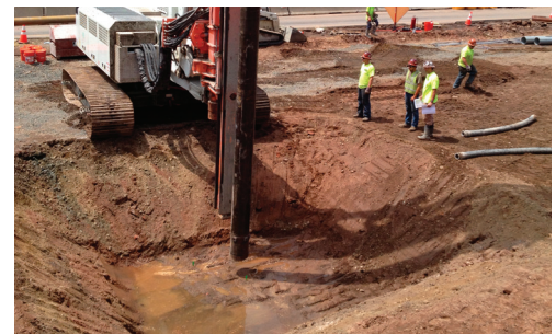
College Avenue Office Building & Garage New Haven, Connecticut