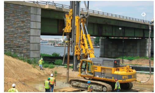
11th Street Bridge Washington, D.C.