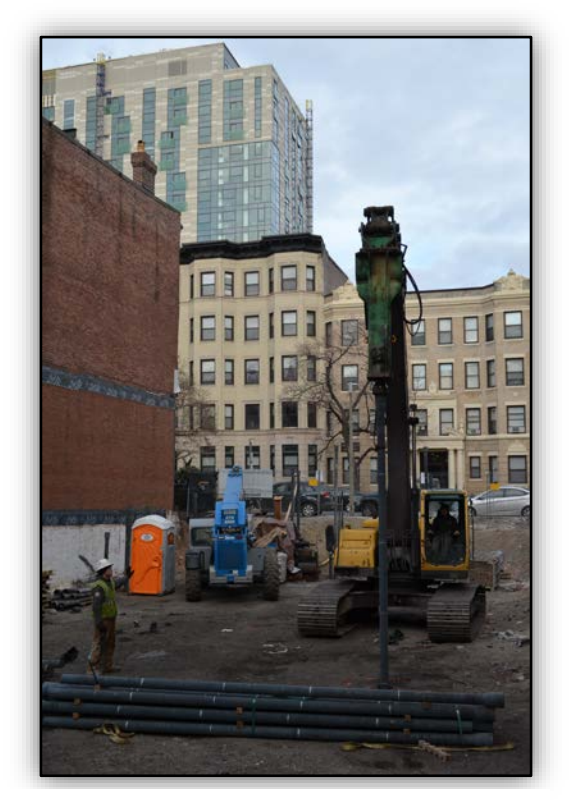
Figure 1: Ductile Iron Pile Installation

Though driven, low vibration levels are actually an extremely important advantage of the Ductile Iron Pile system compared with other