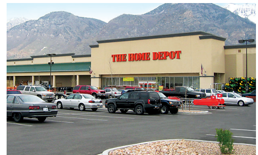
The Home Depot Provo, Utah