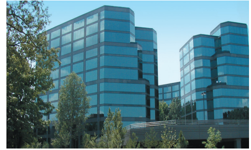
International Place Towers III Memphis, Tennessee