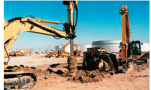
Houston Fuel Oil Terminal Company Houston, Texas