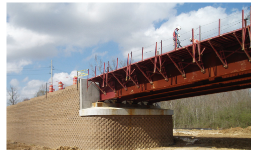
I-10 and Picardy Avenue Interchange Baton Rouge, Louisiana

Geopier Foundation Company developed the Rammed Aggregate Pier® (RAP) system to provide an efficient and cost effective Intermediate Foundation® solution for the support of settlement sensitive structures. Through continual research and development, we've expanded our system capabilities to offer you more. Our design-build engineering support and site specific modulus testing combined with the experience of providing settlement control for thousands of projects provides an unmatched level of support and reliability to meet virtually all of your ground improvement challenges.