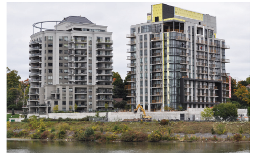
The Grand Condo Cambridge, Ontario