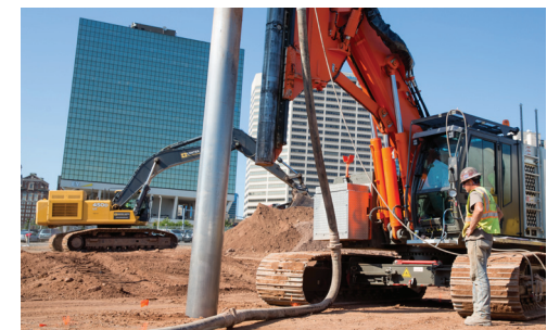
North Hartford Minor League Ballpark North Hartford, Connecticut

Geopier Foundation Company developed the Rammed Aggregate Pier (RAP) system to provide an efficient and cost effective Intermediate Foundation® solution for the support of settlement sensitive structures. Through continual research and development we've expanded our system capabilities to offer you more. Our design-build engineering support and site specific modulus testing combined with the experience of providing settlement control for thousands of projects provides an unmatched level of support and reliability to meet virtually all of your ground improvement challenges.