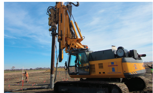
South Dundas Wind Project Brinston, Ontario