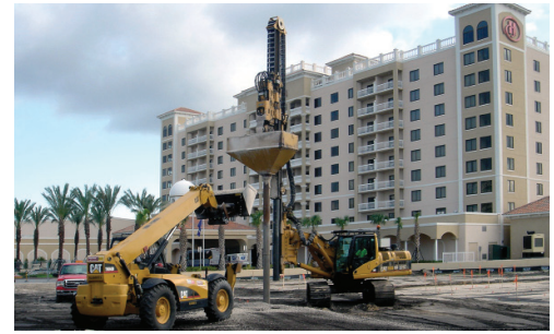
Echelon Pointe at Carillon St. Petersburg, Florida

©2016 Geopier Foundation Company, Inc. The Geopier® technology and brand names are protected under U.S. patents and trademarks listed at www.geopier.com/patents and other trademark applications and patents pending. Other foreign patents, patent applications, trademark registrations, and trademark applications also exist.