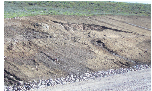
Salina, Utah: Stabilizing a slide activated by road widening