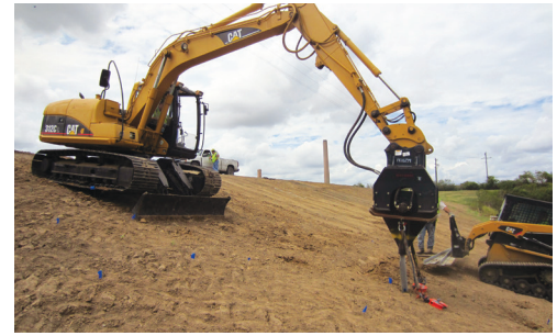
New Madrid, Missouri: Levee repair