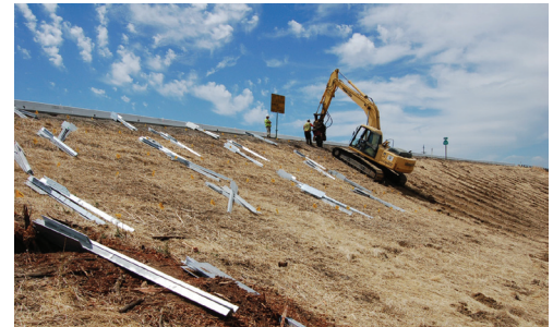
Williams, California: Stabilizing 1.5 miles of ramp slopes for CA DOT

Geopier Foundation Company developed the Rammed Aggregate Pier (RAP) system to provide an efficient and cost effective Intermediate Foundation® solution for the support of settlement sensitive structures. Through continual research and development we've expanded our system capabilities to offer you more. Our design-build engineering support and site specific modulus testing combined with the experience of providing settlement control for thousands of projects provides an unmatched level of support and reliability to meet virtually all of your ground improvement challenges.