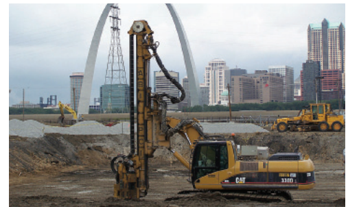
Casino Queen Hotel & Casino East St. Louis, Illinois