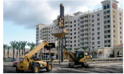
Echelon Pointe at Carillon St. Petersburg, Florida

©2016 Geopier Foundation Company, Inc. The Geopier® technology and brand names are protected under U.S. patents and trademarks listed at www.geopier.com/patents and other trademark applications and patents pending. Other foreign patents, patent applications, trademark registrations, and trademark applications also exist.