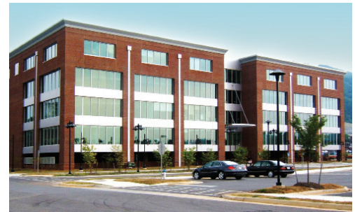
Carilion Riverside Medical Building Roanoke, Virginia