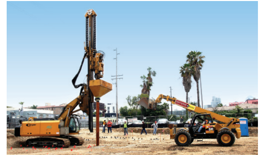
A-1 Storage San Diego, California