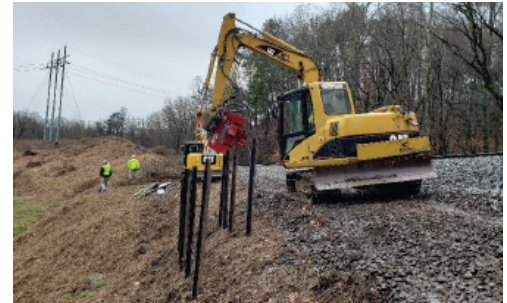
Harriman, Tennessee: Norfolk Southern Embankment Slope