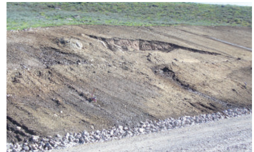
Salina, Utah: Stabilizing a slide activated by road widening