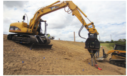
New Madrid, Missouri: Levee repair