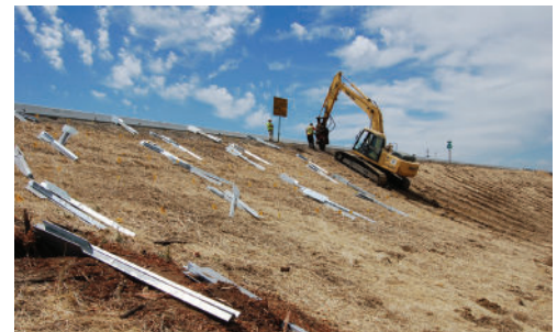
Williams, California: Stabilizing 1.5 miles of ramp slopes for CA DOT

Geopier Foundation Company developed the Rammed Aggregate Pier (RAP) system to provide an efficient and cost effective Intermediate Foundation® solution for the support of settlement sensitive structures. Through continual research and development we've expanded our system capabilities to offer you more. Our design-build engineering support and site specific modulus testing combined with the experience of providing settlement control for thousands of projects provides an unmatched level of support and reliability to meet virtually all of your ground improvement challenges.