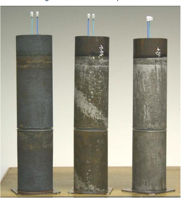
Figure 5: Picture of Samples after Testing (post-cleaning)

In summary, the Ductile Iron Pile exhibits superior corrosion protection. The ductile pile material performed better than steel in the simulated corrosive environment with only localized areas of corrosion product and shallow pitting – a vast difference compared to the overall performance of the steel sections.