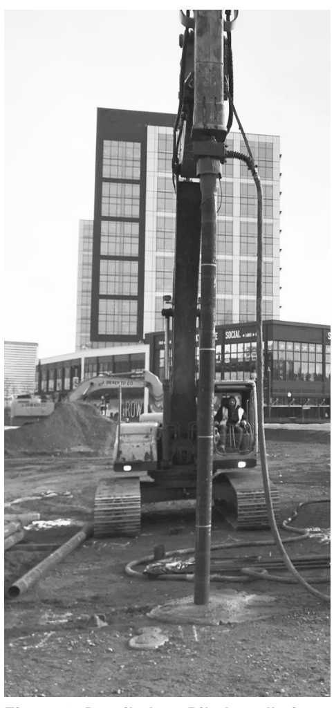
Figure 6: Ductile Iron Pile Installation

Ductile Iron Pile design loss rates of 1.5 mm per side (1/32-inch) are often incorporated for a mild corrosion rate. A value of 3 mm per side (1/16-inch) applies to a moderate rate. Highly-aggressive environments are often addressed using a grout encapsulation approach.