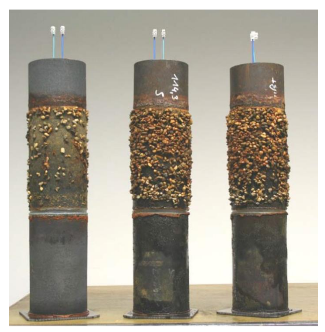
Figure 4: Picture of Samples after Testing (pre-cleaning)

In contrast, the steel samples behave as an actively corroding metal. The rolling skin from the manufacturing process offered far less protection than the Ductile Iron casting skin, resulting in a more wide-spread pattern of corrosion evidenced by the nearly complete coverage of pebbles to corrosion locations (Figure 5). The development of this corrosion layer does have a benefit by acting to reduce the access to oxygen and reduce continued corrosion with time only after substantial corrosion has occurred. The presence of the electrical current created by coupling with the upper section intensified the corrosion and the dissolution of the rolling skin in the lower portion.