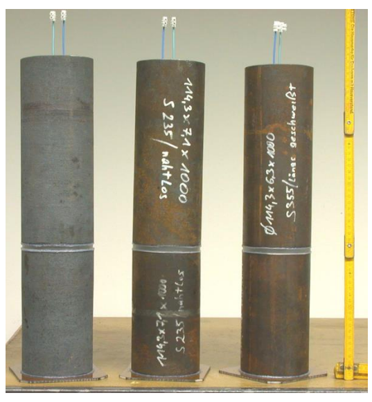
Figure 1: Picture of Samples prior to Testing

The testing found that the high-temperature casting annealing skin created as a part of the Ductile Iron Pile manufacturing process covers and adheres to the pile surface and provides superior protection to the metal beneath. The results show that this casting skin is dense and well-adhering to the piling. The integrity of the skin as well as its protective nature is evidenced by the lack of pebbles adhering to the pile surface in Figure 5. In the upper oxygen-rich portion of the test setup, the number of locations forming corrosion products in crevices between the pile surface and the pebble were few.