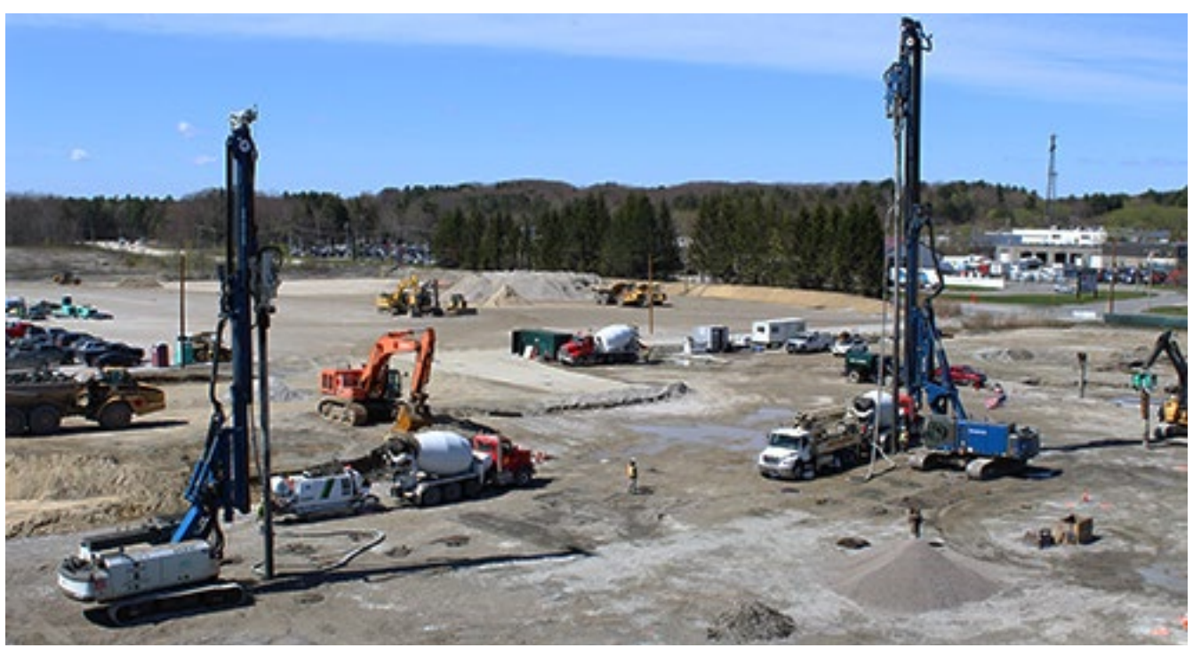
▶ Two Geopier® GeoConcrete® Column (GCC) rigid inclusion crews operate on a well-prepared Working Platform.

During construction, on-site observation and documentation of WP preparation by the project geotechnical consultant is important to help ensure consistency with the project planning phase.