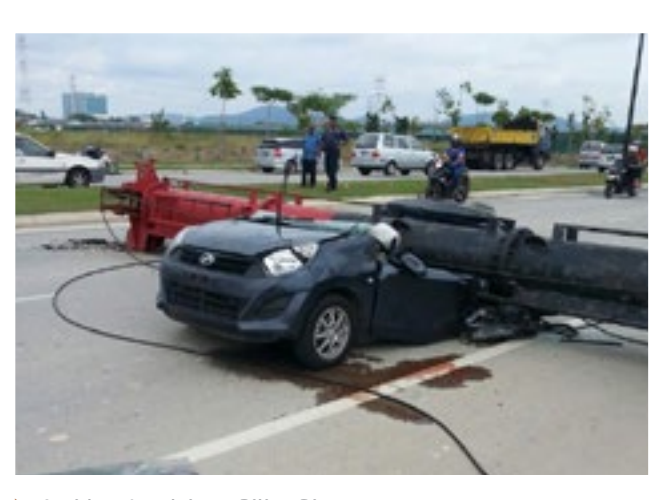
▶ Accident Involving a Piling Rig

After numerous serious accidents attributed to inadequate Working Platforms, industry trade organizations at the national level recognized the critical need to address Working Platform deficiencies. A joint effort between EEFC/DFI/ADSC developed thorough guidelines and recommendations detailing Working Platform design and performance. Our three-part narrative is intended to provide a high-level review of Working Platforms. Much greater detail can be provided by reviewing the reference guidelines, which can be found here.